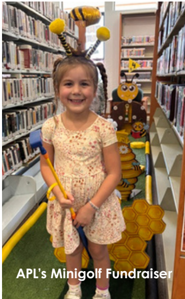
APL's Minigolf Fundraiser