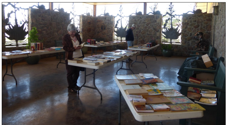
Rare & Interesting Book Sale on the patio