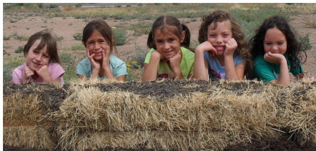
Above: Read-n-Seed gardeners